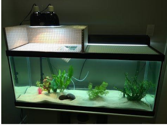
*Example Images 2 and 3.