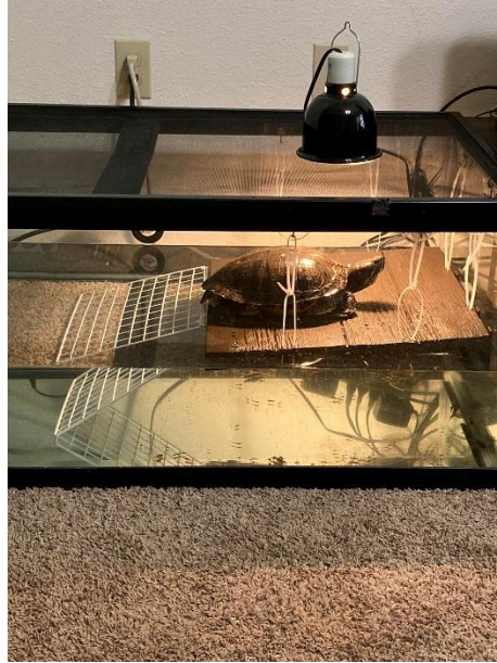
Example image using Menard's Decking Tile, wire grating, and suction cups with zip ties.

When it comes to the maintenance and proper care of many species of aquatic to semi-aquatic turtles in captivity or as pets, providing a proper and dry “basking area” out of the water is essential for maintaining these animal’s health and well-being. Indeed, basking is an important activity for these shelled reptiles throughout the day in order for them to properly and adequately thermoregulate, as well as providing them an opportunity to get out of the water to dry off, and potentially prevent bacterial, fungal, and other infections or health implications.